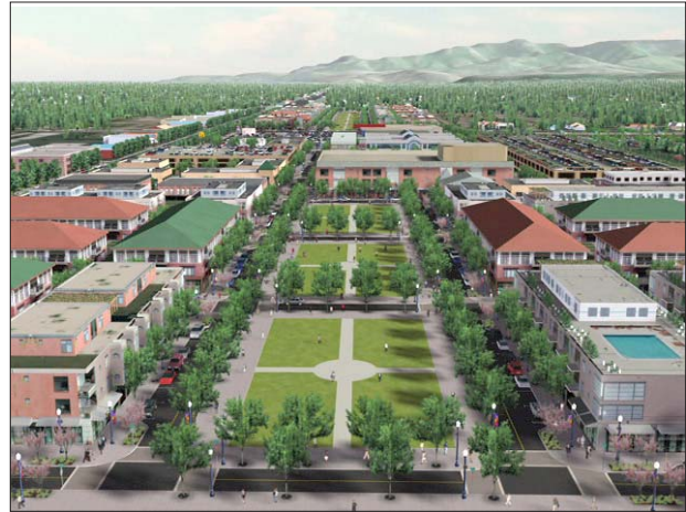
Spokane Transit-Oriented Development

The firm's recent work includes the Portland Downtown Retail Strategy with the national firm of Economics Research Associates as the prime